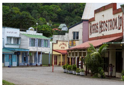
B9: Old Levuka town