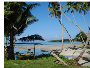
B4: Devodara, nr Savusavu