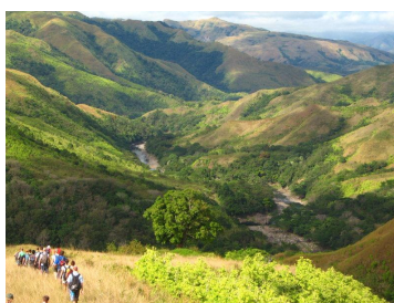
B10: Sigatoka Valley