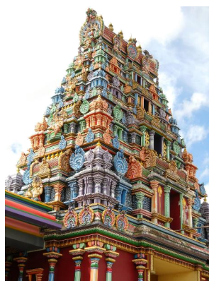
B5: Temple at Nadi