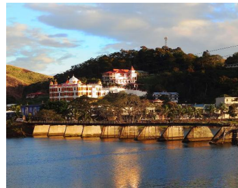
B3: Sigatoka, early morning