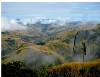
B1: Talasiga hills of Ra