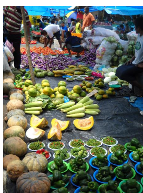
B6: Variety at Suva market