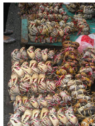
B7: Lairo crabs