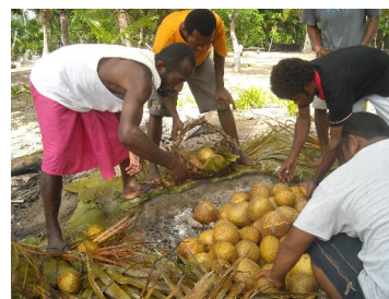
B11: Uto ni lovo, Moturiki