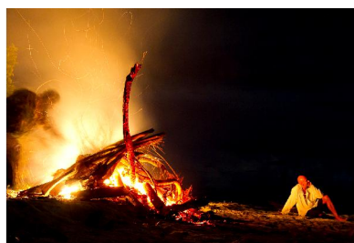
B2: Bonfire, Cagalai Island